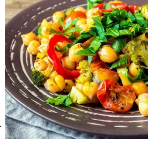
Good Gut Health

then drizzle in the tahini until the desired consistency has been reached. Mix well.